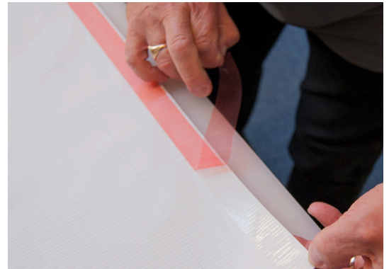
Removing the backing