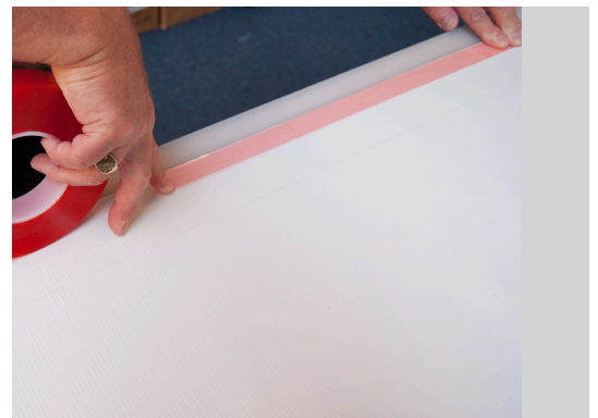
Applying the tape