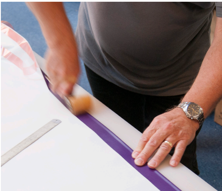
Strengthening the bond