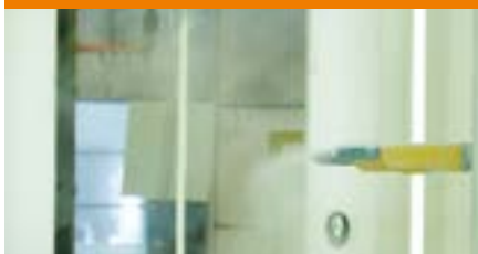
Powder coat and liquid painting

3M VHB Tape GPH's high temperature resistance allows it to be bonded prior to powder coat or liquid painting processes. This reduces the number of "touches," leading to a more streamlined manufacturing process.